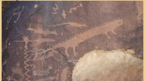
Molen - Utah