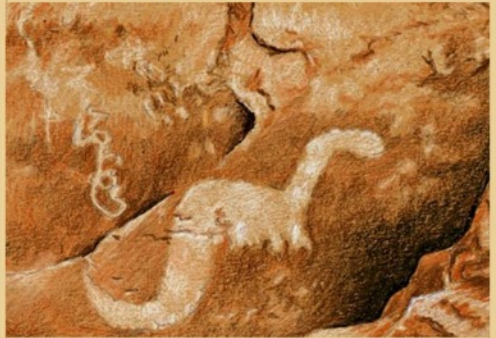
Stegosaurus of the Anasazi Indians