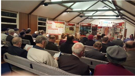
This photo was taken during our visit and was the last meeting in the hall.

We were at Randalstown in March and that was the last event in their hall before it was demolished due to its poor state of repair, in readiness for a new hall to be build on the same site. This building work is well under way and the saints are looking to have it finished at the beginning of March, God willing, in time for their children's meeting prize giving.